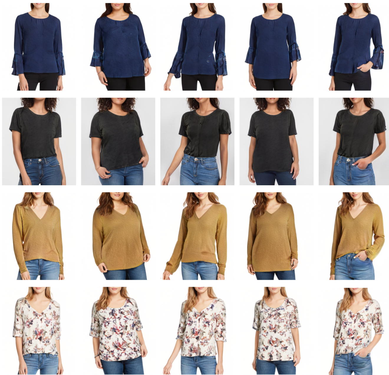
Figure 12: Our method can synthesize the same style shirt for varied poses and body shapes by fixing the style vector. We present several different styles in multiple poses. In this figure, each row is a fixed style, and each column is a fixed pose and body shape.