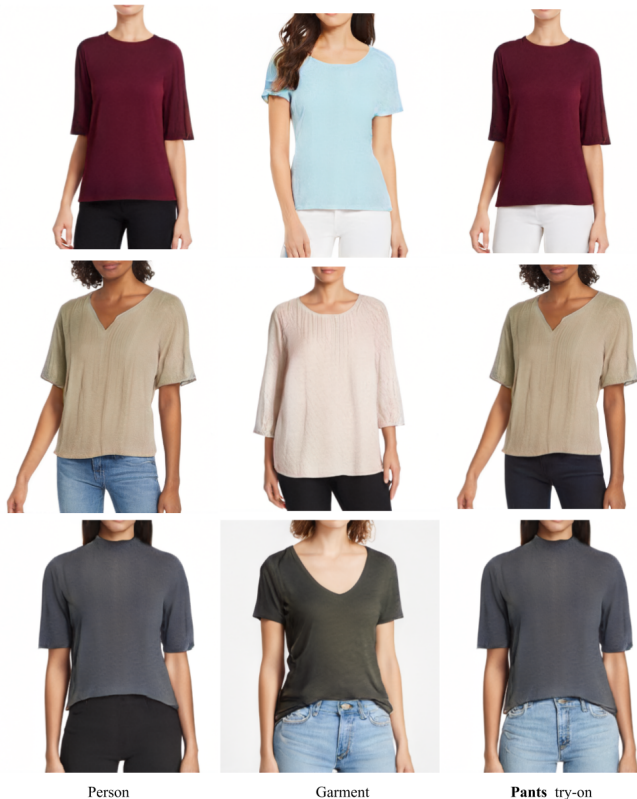
Figure 5: Results from our method for pants try-on. Note how try-on works well with different body shapes, and adjusts to the new poses. Each row corresponds to a different try on result. Columns represent person, garment, and result.