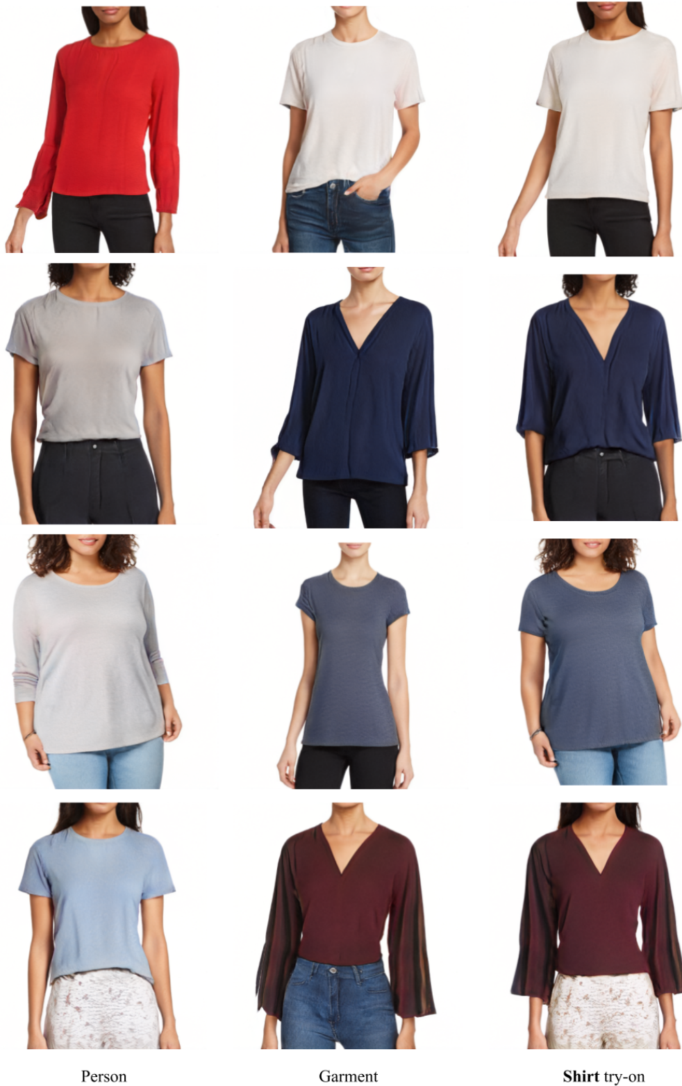
Figure 4: Results from our method for shirt try-on. Note how try-on works well with different body shapes, and adjusts to the new poses. Each row corresponds to a different try on result. Columns represent person, garment, and result.