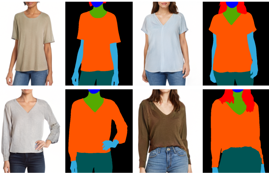
Figure 11: We train a pose-conditioned StyleGAN2 network to output segmentations in addition to RGB images. The figure shows our typical generated images and their corresponding segmentation.