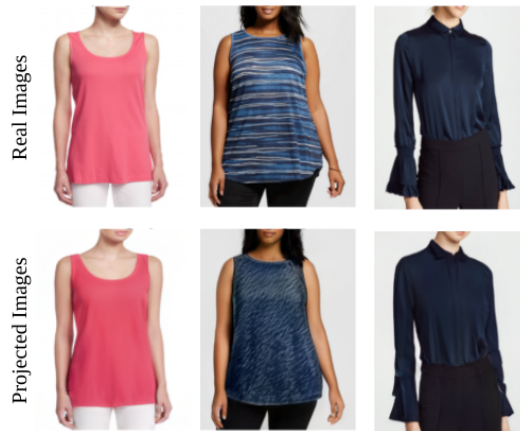
Figure 6: To experiment with real input images (rather than StyleGAN generated) we have used standard projection algorithm. Here we show typical results of projection on our images. Is it useful to see the effect of projection on the quality of the garment representation, since it directly impacts the final try on result. Improving the projection is independent of our optimization algorithm and is part of future work.

Results Figure 1, Figure 4, and Figure 5 show try-on results produced by our method. Note the diversity of the