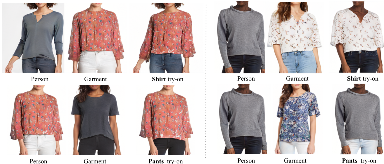
Figure 1: VOGUE is a StyleGAN interpolation optimization algorithm for photo-realistic try-on. Top: shirt try-on automatically synthesized by our method in two different examples. Bottom: pants try-on synthesized by our method. Note how our method preserves the identity of the person while allowing high detail garment try on.