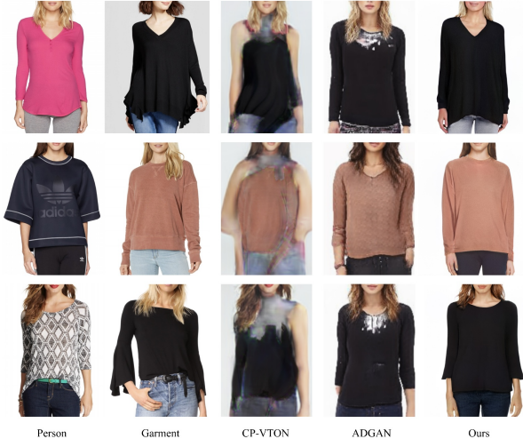
Figure 7: Qualitative comparison with [30] and [22]. Each row represents a different pair of inputs. Note the difference in garment quality, adjustment to difference in body shape, skin color, and pose. VOGUE outperforms the state of the art significantly. Please refer to supplementary material for more results.

of our optimization method (see Figure 4 for interpolation without projection). Therefore improving projection as future work would continue to improve our final try-on images.