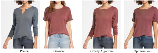
Figure 10: Ablation study: we compare greedy search for interpolation coefficients as in [6] to our optimization approach. We observe that details like sleeve length and pattern are preserved much better with the per layer optimization approach. Note that we do not compare directly to [6] since we also modified the StyleGAN architecture to include segmentation and condition on pose.

the loss function. We run this ablation study on real images and demonstrate that each loss term is necessary for a photo-realistic result that preserves garment characteristics and person identity. The localization loss prevents the optimization from editing semantic regions outside of the garment of interest. The identity loss preserves the face and hair. The garment loss transfers the shape, color, and texture of the garment.