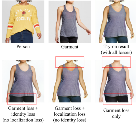
Figure 9: Ablation study showing the importance of each loss term in the optimization. The study is done on real images.