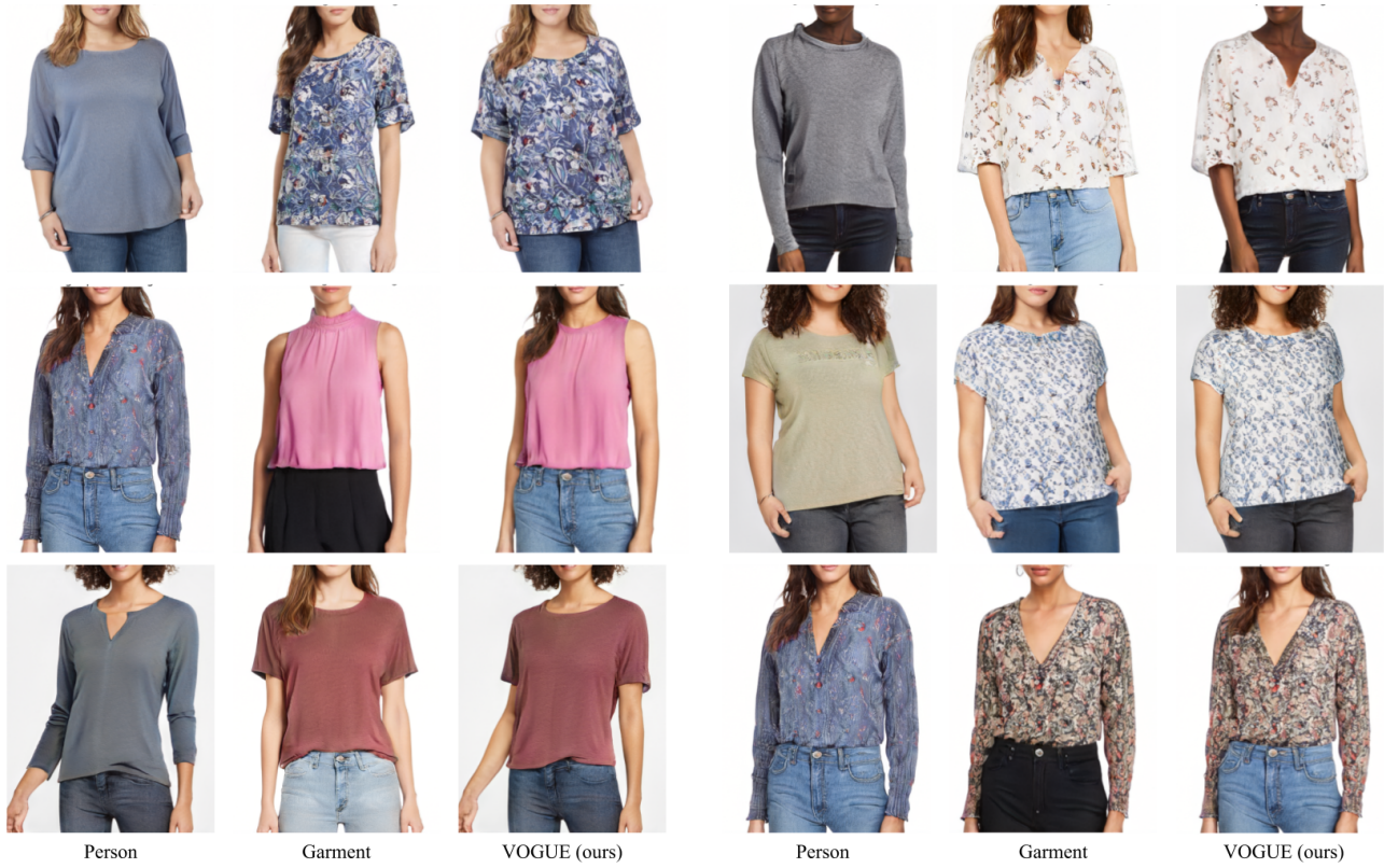
Figure 13: Results. We present 6 examples, note the difference in body shape, skin color, types of shirts.