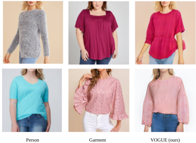
Figure 8: Failure cases for our method. Our method typically fails when garment detail or pose wasn’t represented well in the training dataset.

culated FID scores for a set of real images. The embedding similarity score measures the distance between embeddings of the original garment and the garment in the try-on image. Our method has the highest similarity which reflects our method’s ability to preserve the shape and details of the try-on garment.